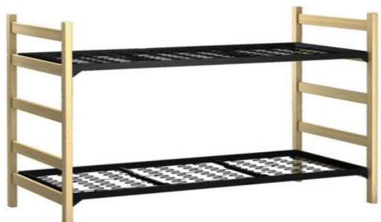
Bunk bed pictured without mattresses. Students on top bunk climb up ladder style bed end.