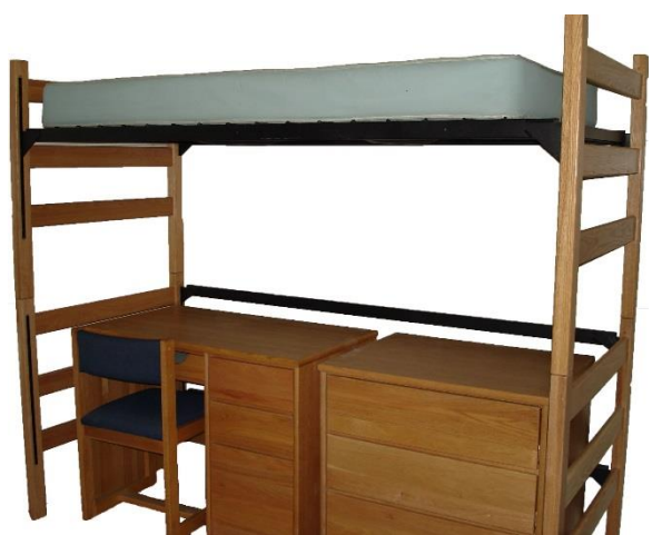
Lofted bed with desk and dresser pictured underneath. One loft kit is currently provided in oversubscribed (tripled) rooms only.