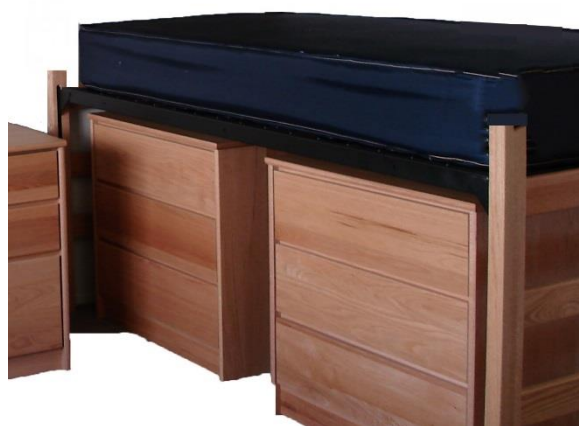
Captain's height bed with dressers pictured underneath. Each student receives one dresser. Some students may decide to put both roommates' dressers under one bed to maximize space in the room.